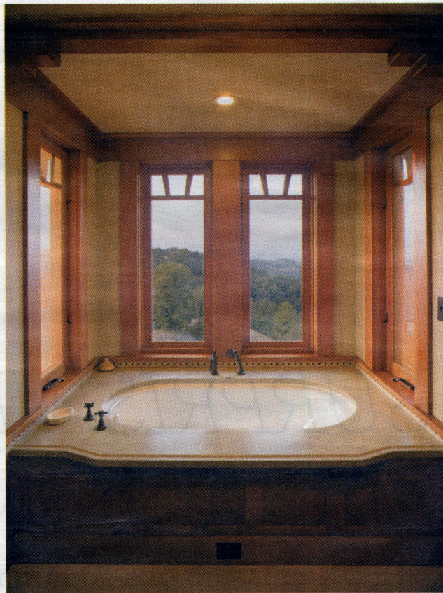
The master bath looks out over the landscape.

Jane Powell is a restoration consultant and the author of “Bungalow Kitchens” and several other bungalow books. She can be reached at janepowell@sbcglobal.net .